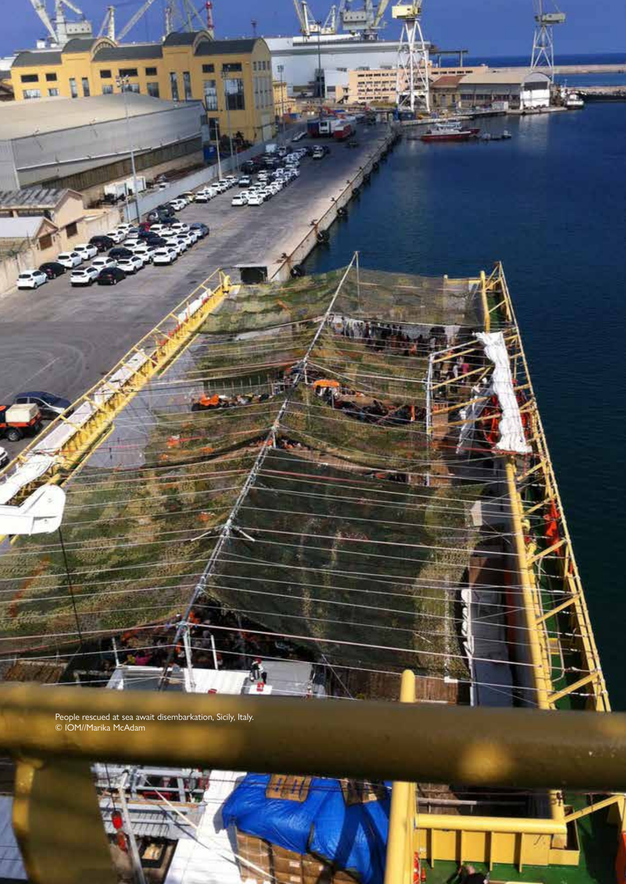
People rescued at sea await disembarkation, Sicily, Italy.