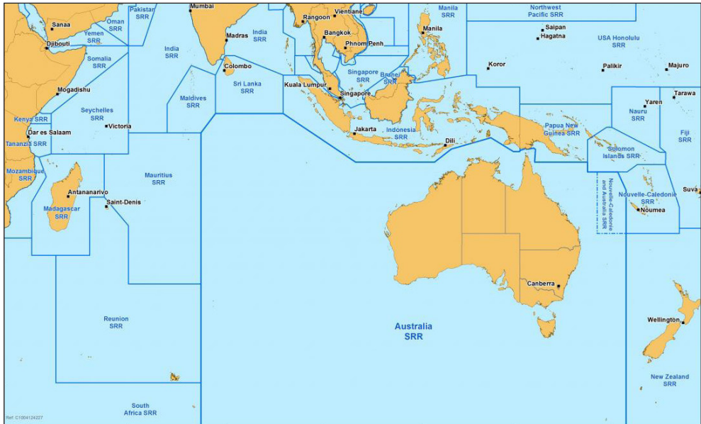
Figure 2: Indian Ocean and South-West Pacific search and rescue regions