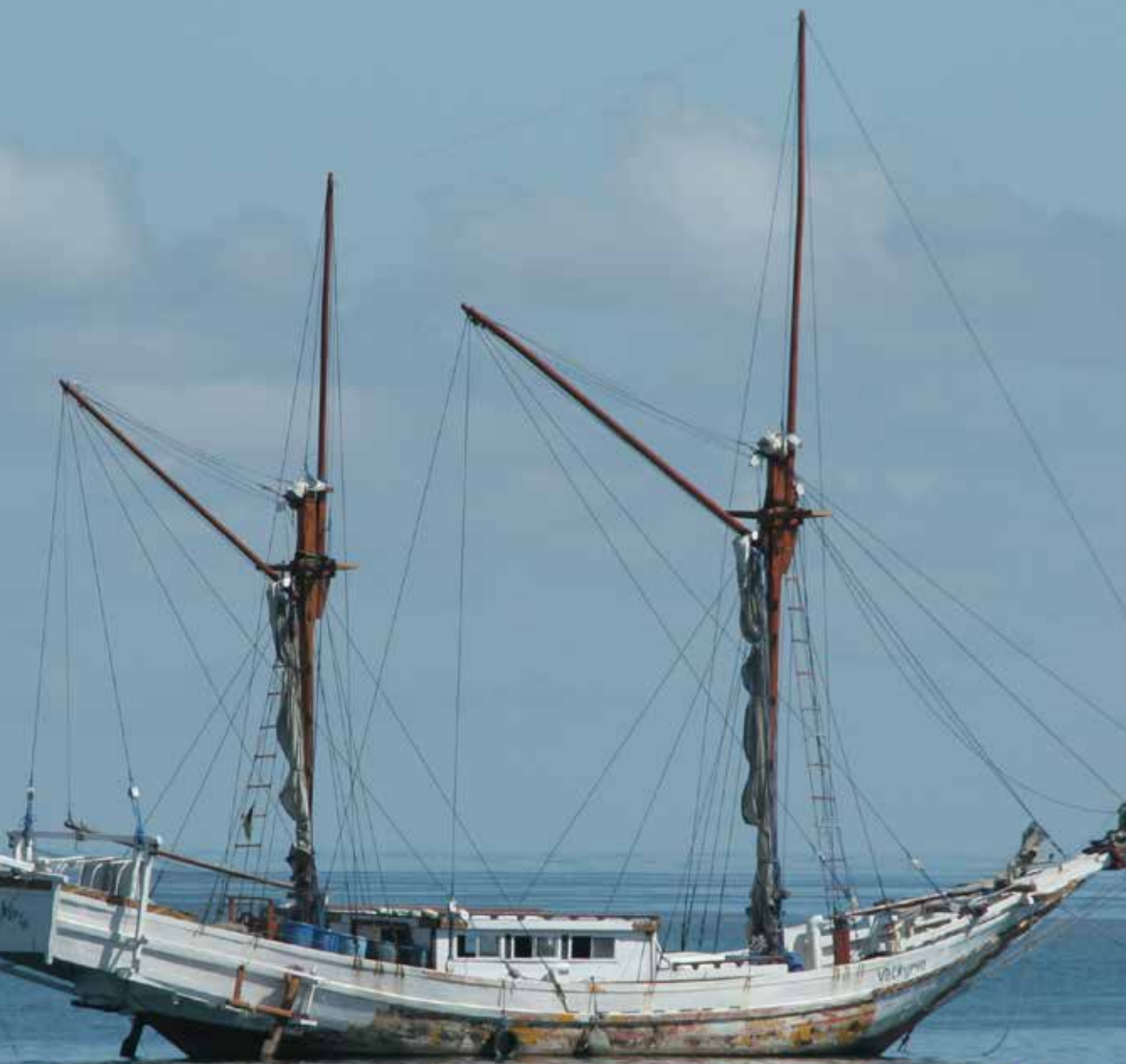
Fishing boat off the coast of Dili, Timor-Leste.