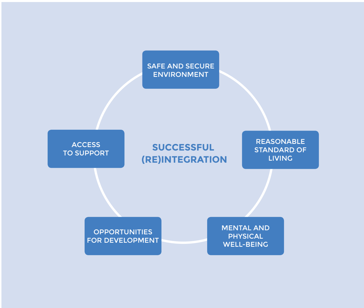
Diagram #1. Components of successful reintegration